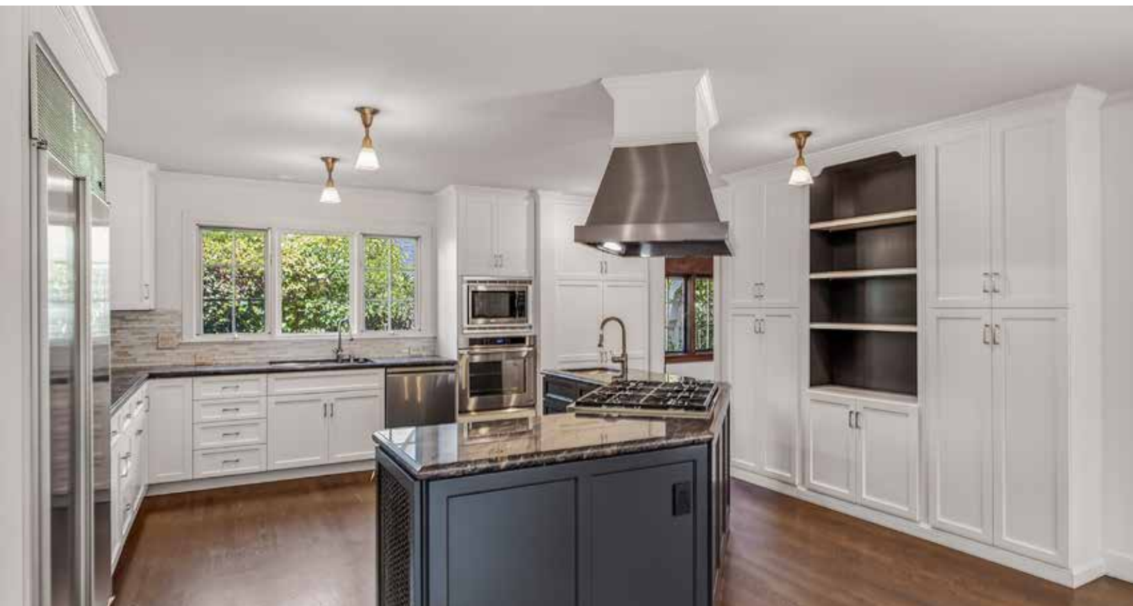
641 CRESCENT AVENUE SAN MATEO PARK