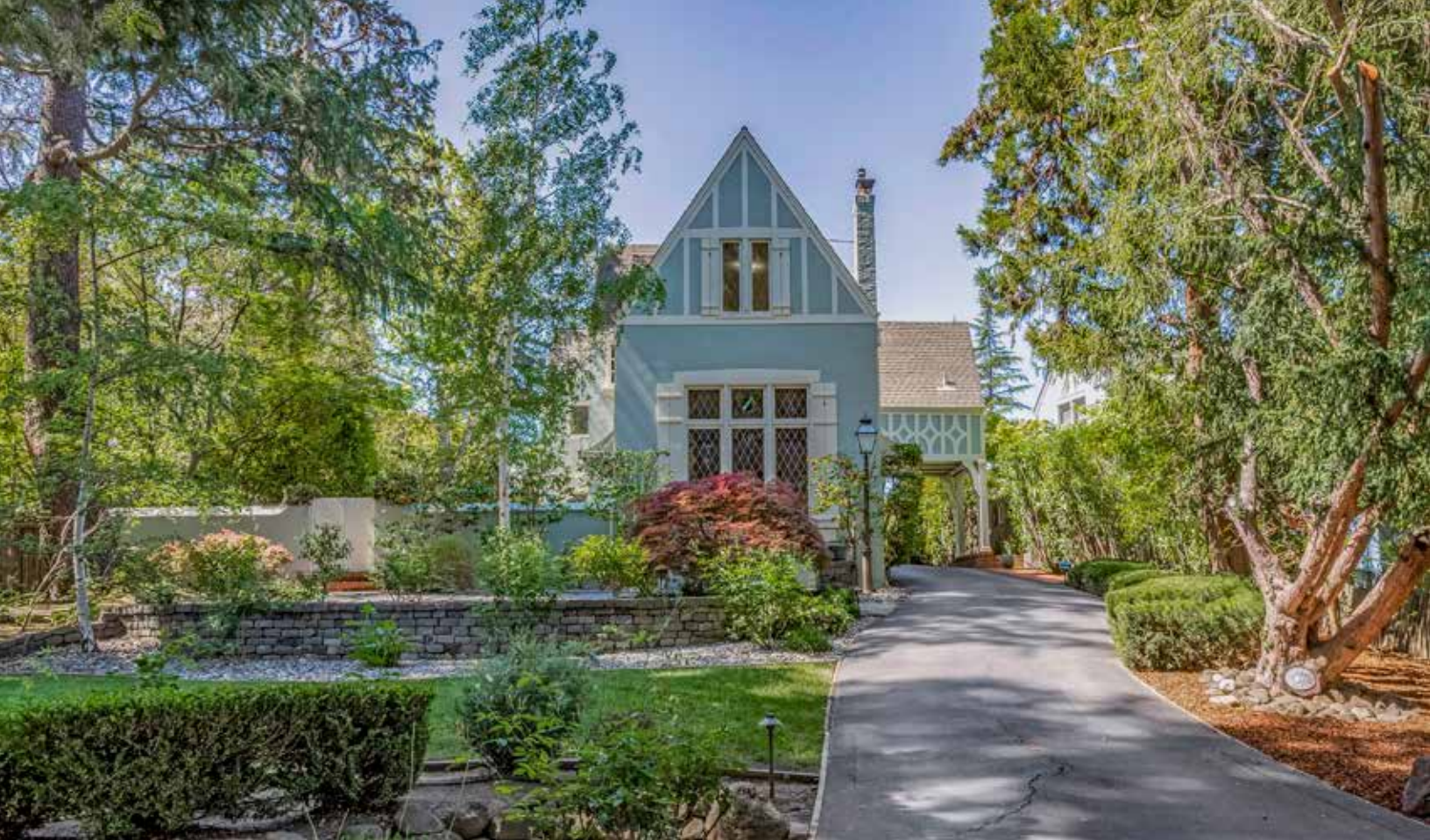
Grand Tudor in San Mateo Park